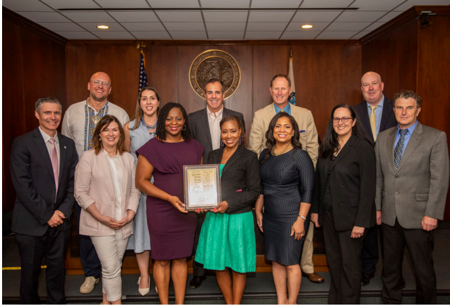
MWRD commissioners and executive staff display a plaque commemorating a United States patent the agency earned for inventing technology with partners from the Iowa State University Research Foundation, to remove dissolved solids from wastewater through an algae recovery system.