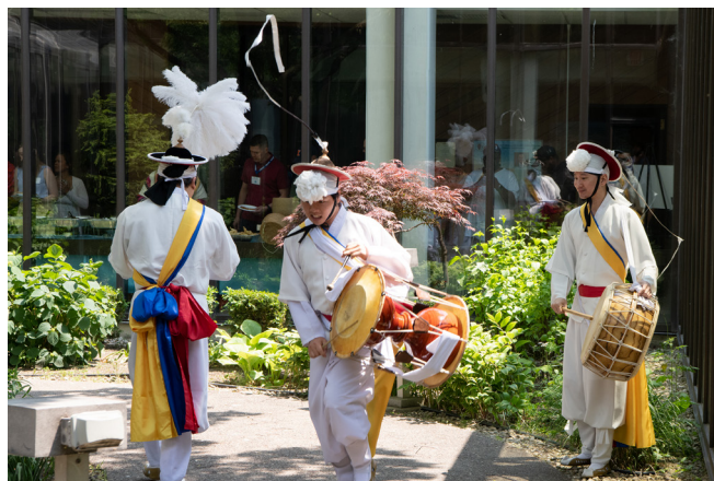
Musicians from the Korean Performing Arts Institute of Chicago (KPAC) performed at the MWRD’s Asian American and Pacific Islander Heritage Month.