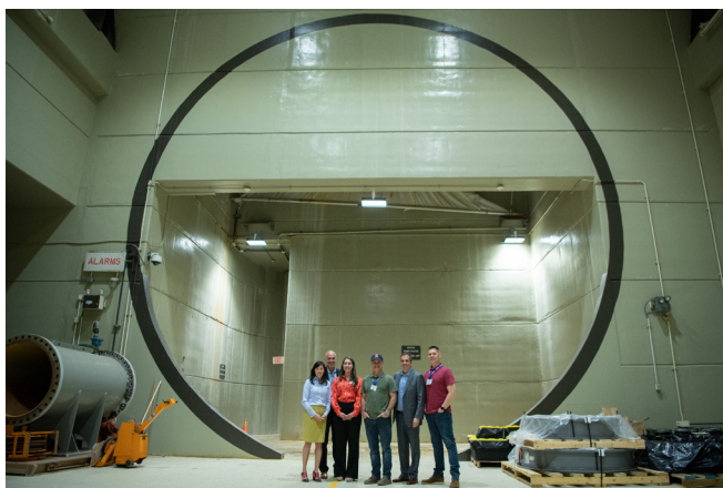
As part of the Asian American Pacific Islander Heritage Month event hosted by the MWRD, Secretary of the Illinois Department of Human Services Grace B. Hou and guests toured the MWRD Mainstream Pumping Station approximately 300 feet below ground.

The event included tours of the pumping station and McCook Reservoir, important components of the MWRD’s Tunnel and Reservoir Plan. These critical pieces of infrastructure are working to protect the waterways from pollution and communities in combined sewer areas from flooding.