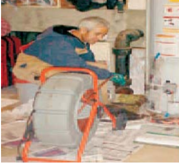
Locating the pipe

<u>The first step</u> in service lateral rehabilitation is locating and inspecting the pipeline. The City of Naperville uses video technology to inspect the pipe. Naperville's sewer inspection truck is