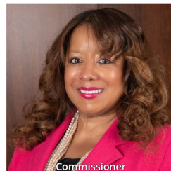
Commissioner Kimberly Du Buclet