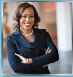
KARI K. STEELE President of the Metropolitan Water Reclamation District of Greater Chicago