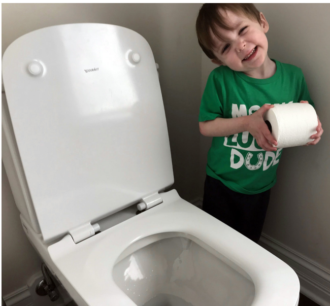
Cashel says "only flush toilet paper!"

The Coronavirus (COVID-19) pandemic has inspired the world to model safe and best cleaning practices. But while disinfecting wipes are effective, the Metropolitan Water Reclamation District of Greater Chicago (MWRD) is seeing a rise in the number of wipes stuck on the screens at water reclamation plants (WRPs) that normally filter out debris during the first critical steps of the wastewater treatment process.