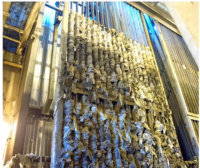
Screens are used to filter out debris as it reaches the MWRD water reclamation plants, but wipes, paper towels, tissues and other products can accumulate and stick to equipment. With more disinfecting wipes being used, the MWRD urges the public to only flush toilet paper.

The MWRD is a member of the National Association of Clean Water Agencies (NACWA). It advises that wipes, paper towels and feminine hygiene products when flushed can cause problems for utilities that amount to "billions of dollars in maintenance and repair costs." These costs are ultimately passed on to taxpayers.