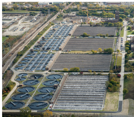
O'Brien Water Reclamation Plant

The Terrence J. O'Brien Water Reclamation Plant (WRP) is one of seven wastewater treatment facilities owned and operated by the Metropolitan Water Reclamation District of Greater Chicago (MWRD). The MWRD is the wastewater treatment and stormwater management agency for the City of Chicago and 125 Cook County communities. We work every day to mitigate flooding and convert wastewater into valuable resources like clean water, phosphorus, biosolids and natural gas.