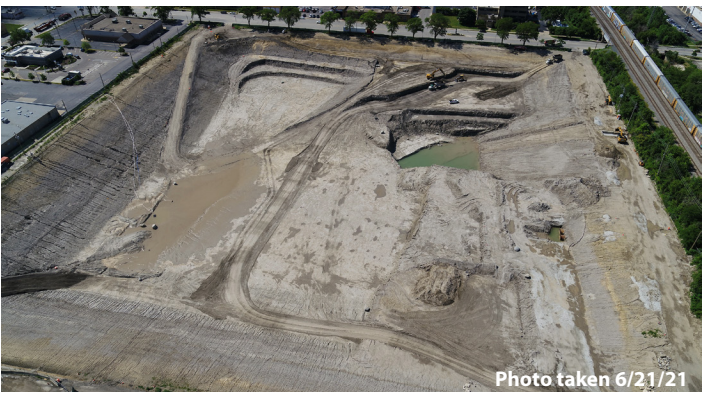
Excavation work progresses on the Addison Creek Reservoir to make room for stormwater that formerly flooded the banks of the Addison Creek.

The MWRD and Bellwood have an intergovernmental agreement (IGA) for the construction and perpetual maintenance responsibilities of the Addison Creek Reservoir Project. The IGA stipulates that the MWRD will design and construct the reservoir, and the village of Bellwood and MWRD will share the maintenance responsibilities of the reservoir.