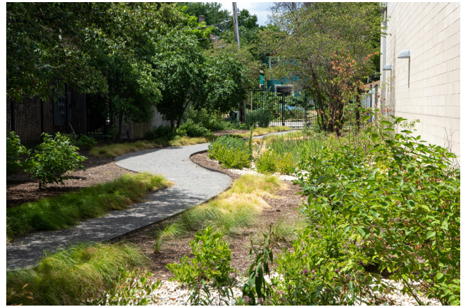
A demonstration rain garden at the Oak Park Public Works facility was completed with funding from the MWRD to better capture stormwater at public spaces inspiring future green infrastructure investments.

"We are committed to the use of green infrastructure to help reduce flooding while reducing the load on the