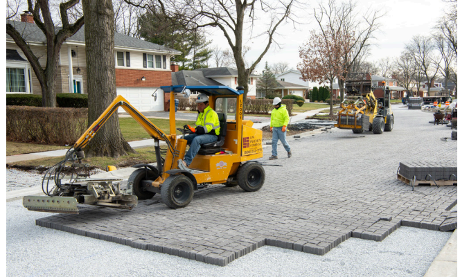
Interlocking concrete permeable pavers installed at places like the Cook County Forest Preserve's Schuth's Grove (left) and Berry Lane in Flossmoor (right) can reduce stormwater runoff, clean and filter stormwater and improve water quality. These projects have been completed through local partnerships funded by the MWRD.

Green infrastructure uses natural or biological modes of controlling stormwater to prevent or reduce the flow of water from entering the sewer system. Stormwater is stored and slowly soaks into the underlying soil. The MWRD's green infrastructure partnership projects vary in size and scope and can include roadside bioswales, rain gardens, green roofs, permeable pavement alleys and parking lots, and green streetscapes.