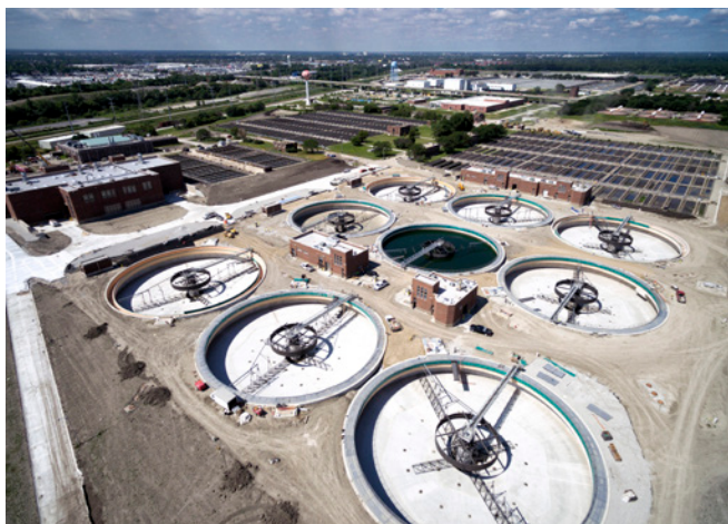
Aerial view of the new primary settling tanks.

The primary settling tanks replace 108 Imhoff tanks that had been in service since 1928. While productive over a significant lifespan, the Imhoff tanks were aging and required replacement. The new tanks will allow the MWRD to increase digester gas production, reducing both energy costs for the MWRD and greenhouse gas emissions.