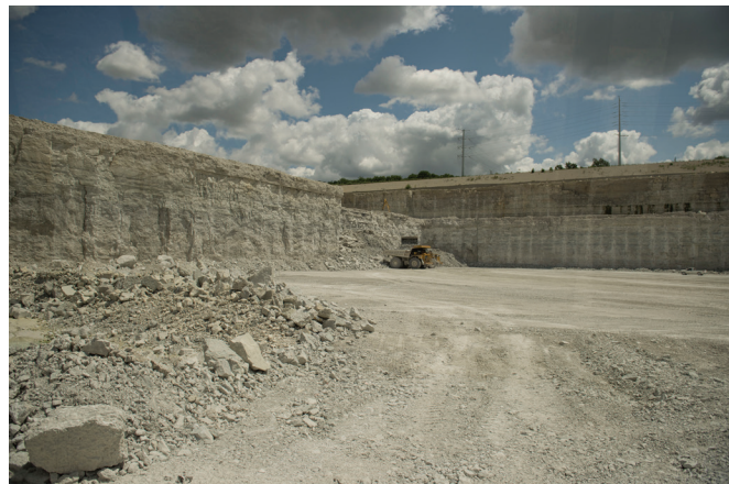
Activity continues on McCook Reservoir Phase 2.

construct with soon to be delivered federal dollars combined with District funds—a new approach to aggressive project management.”