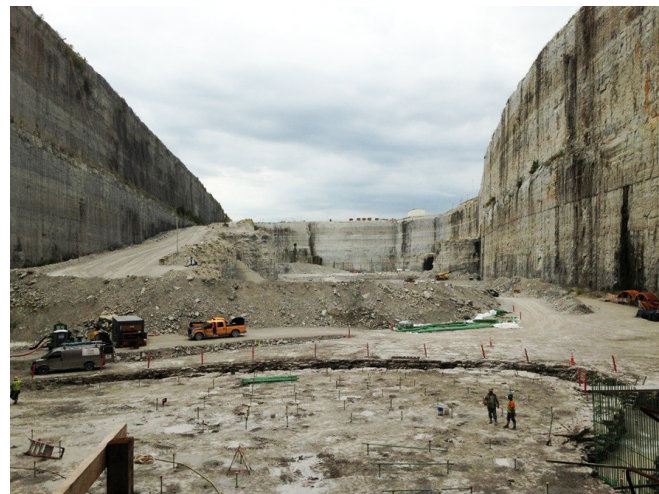
The first section of the McCook Reservoir, holding 3.5 billion gallons, is nearing completion in 2017. The reservoir is part of the Metropolitan Water Reclamation District of Greater Chicago's Tunnel and Reservoir Plan (TARP) that captures and stores combined stormwater and sewage that would otherwise overflow from sewers into waterways or local basements during storms.

"The McCook Reservoir is critical in our efforts to protect Chicagoans and their property from destructive and costly urban flooding," said Rep. Quigley. "I applaud President Obama for signing this legislation into law, requiring the U.S. Army Corps of Engineers to expedite completion of this critical project that is already among the nation's most economically beneficial to local residents."