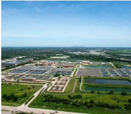
A view of Calumet WRP, looking north toward downtown Chicago

The Calumet Water Reclamation Plant (WRP) is one of seven wastewater treatment facilities owned and operated by the Metropolitan Water Reclamation District of Greater Chicago (MWRD). The MWRD is the wastewater treatment and stormwater management agency for the City of Chicago and 125 Cook County communities. We work every day to mitigate flooding and convert wastewater into valuable resources like clean water, phosphorus, biosolids and natural gas.