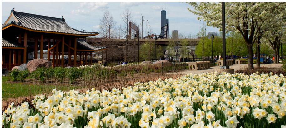
MWRD biosolids, a sustainable alternative to chemical fertilizers, help beautify the Chicago Park District's Ping Tom Park.