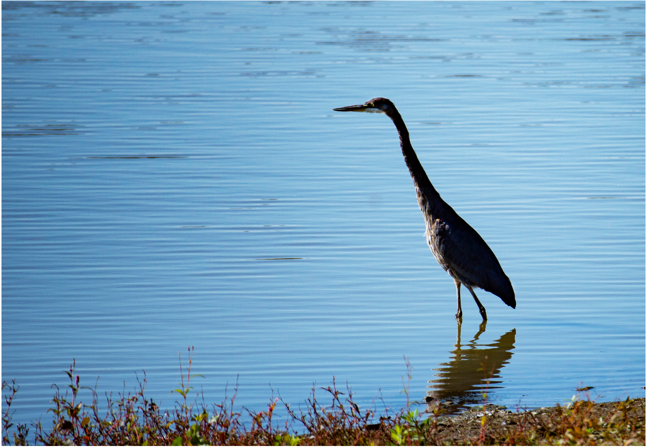
Black egrets are among the wildlife found along the MWRD's waterways.

Back Cover: In 2020, the MWRD partnered with the Illinois Monarch Project to help protect monarch butterflies from becoming extinct. Studies suggest that monarch butterfly populations have rapidly declined due to habitat loss and climate change. Milkweed is the sole source of food for monarch caterpillars. As the regional authority for stormwater management, the MWRD has invested in native prairie landscaping across its land because native plants, like milkweed, play an important role in absorbing more water. With extensive root systems, native plants can help reduce flooding and also help improve local water quality.