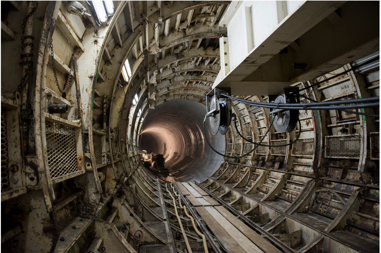
Construction on the Des Plaines Inflow Tunnel (DPIT) nears completion to connect the 26-mile Des Plaines Tunnel System to the McCook Reservoir to capture and store combined stormwater and sewage that previously overflowed from sewers into waterways in rainy weather.