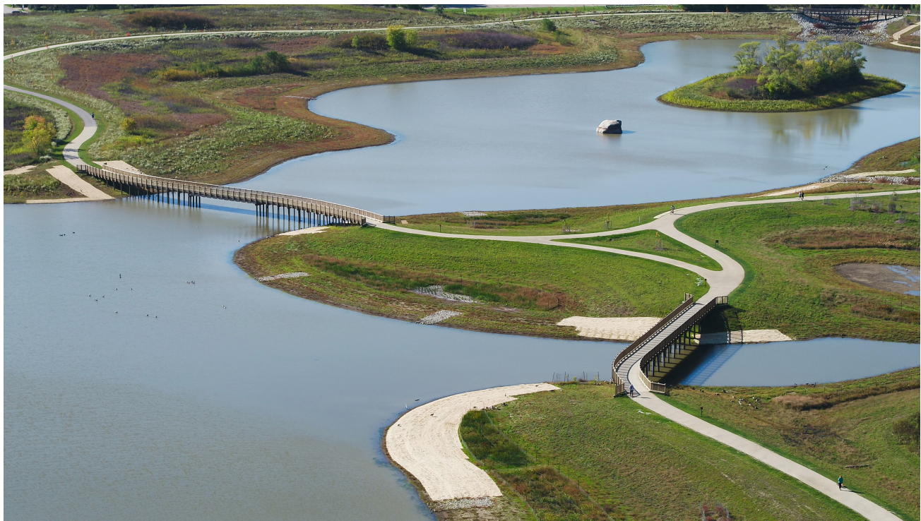
The Buffalo Creek Reservoir Expansion project has increased the reservoir's flood volume by 180.7 acre-feet, expanded the open water area by 6.3 acres and the wetland area by 14.8 acres, and planted new vegetation in an emergent zone area enlarged by 4.5 acres.