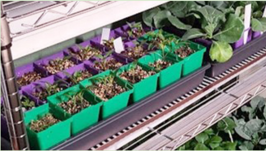
Seeds planted in a soil mix including 50% EQ compost germinated indoors and grow prior to transplanting in a garden.