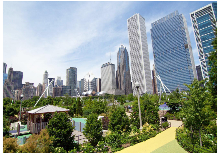
Trees established in EQ Compost at Maggie Daley Park in downtown Chicago provide shade and beauty.

1. Add Shade - Does your park or yard need a relaxing area out of the sun for enjoying summer days? You can use EQ Biosolids, either air-dried biosolids or EQ Compost to improve the root zone for trees and shrubs at planting. EQ Compost will add organic matter and improve soil health, as well as help the water-holding capacity of soil during those hot summer days.