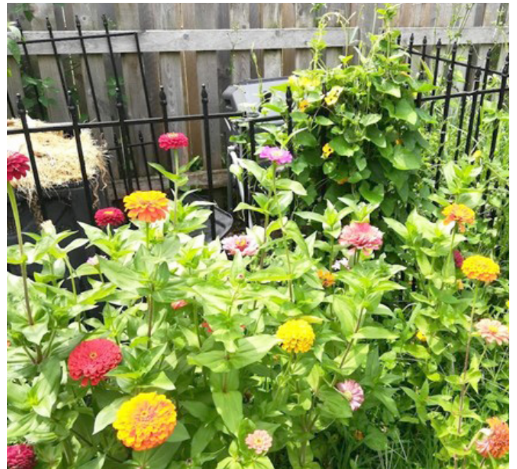
A flower garden grown in EQ Compost helps hide compost bins from view in a suburban backyard.

5. Cover up eyesores - Improve the aesthetics of unattractive areas using EQ Compost. Bins, outdoor boxes, and other man-made necessities can be eyesores in an otherwise peaceful garden or park. Mowing around these objects is a challenge and can lead to added maintenance with hand-held tools. Why not create a wildflower garden around the object? This can result in easier mowing, attractive flowers, and a screen to hide the eyesore from view. Using EQ Compost as a soil amendment during establishment and mulch each winter can help create a thriving low-maintenance garden.