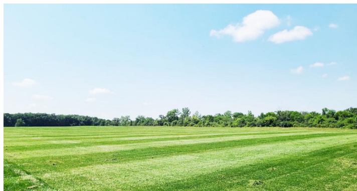
A driving range established with EQ Biosolids for The Longest Drive Competition at Cog Hill Golf and Country Club. The surface was previously clay soil with little organic matter. EQ Biosolids provided the support needed by the turfgrass to be a lush green range.

2. Restore your green space - Many of us deal with thinning damaged grass on compacted soils in various parts of athletic fields, picnic areas, or back yards. Using a thin layer of EQ Biosolids (about ¼") can revitalize these damaged areas. The added organic matter helps reduce compaction and feeds that hungry grass. For added benefit, try topdressing along with aerating those highly compacted areas.