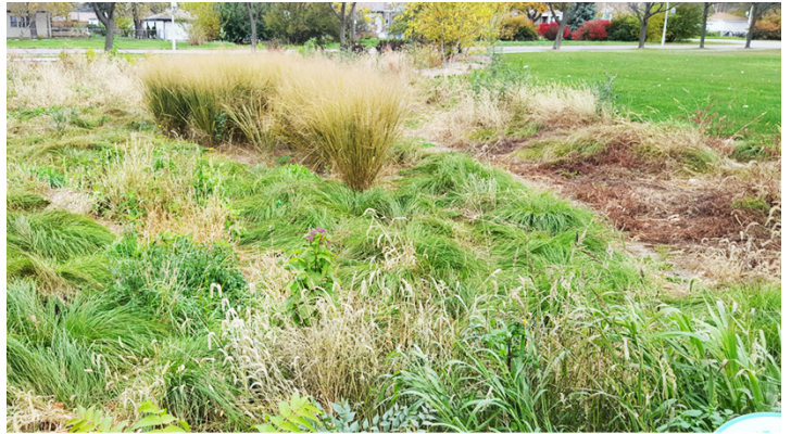
A bioswale created through a partnership with MWRD stormwater engineering to alleviate flooding in this park.

3. Improve water management - Managing an area that is perpetually puddled during and after rain events can be frustrating. Is water running off your impermeable surfaces and making your play areas too soggy to use? Install a rain garden or bioswale to direct runoff to a specific area designed to hold water during rain events and reduce flooding elsewhere. We recommend a mix of EQ compost and sand to improve drainage. Adding plants that thrive in both wet and dry conditions will make this a vibrant garden-area.