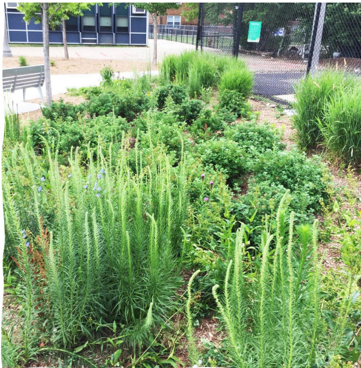
Pollinator friendly plants create a beautiful habitat next to a school yard that was transformed through the Space to Grow program.

5. Cover up eyesores - Improve the aesthetics of unattractive areas using EQ Compost. Bins, outdoor boxes, and other man-made necessities can be eyesores in an otherwise peaceful garden or park. Mowing around these objects is a challenge and can lead to added maintenance with hand-held tools. Why not create a wildflower garden around the object? This can result in easier mowing, attractive flowers, and a screen to hide the eyesore from view. Using EQ Compost as a soil amendment during establishment and mulch each winter can help create a thriving low-maintenance garden.