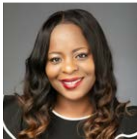
Commissioner Yumeka Brown