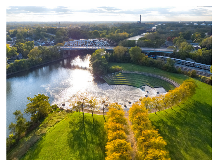
Fall colors at sunset over the MWRD's Sidestream Elevated Pool Aeration Staion #3 on the Cal Sag Channel in Blue Island.

date, District personnel will then conduct a sampling study to verify compliance.