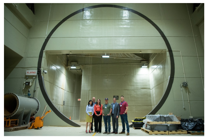
As part of the Asian American Pacific Islander Heritage Month event hosted by the MWRD, Secretary of the Illinois Department of Human Services Grace B. Hou and guests toured the MWRD Mainstream Pumping Station approximately 300 feet below ground.

The event included tours of the pumping station and Mc-Cook Reservoir, important components of the MWRD's Tunnel and Reservoir Plan. These critical pieces of infrastructure are working to protect the waterways from pollution and communities in combined sewer areas from flooding.