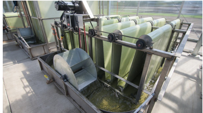
Algae naturally uptakes phosphorus and nitrogen from water to support its growth through photosynthesis, utilizing the sun as its energy source here at the MWRD's greenhouse at O'Brien Water Reclamation Plant.

The process of cultivating and harvesting algae for the purpose of removing nutrients from wastewater is known as phycoremediation. Algae naturally uptakes phosphorus and nitrogen from water to support its growth through photosynthesis, utilizing the sun as its energy source. The MWRD has an endless supply of water, nutrients, sunlight and moderate temperatures required to grow the algae.