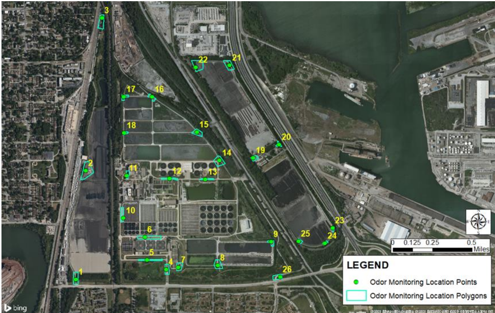
FIGURE AI-1: ODOR MONITORING LOCATIONS AT THE CALUMET WATER RECLAMATION PLANT AND SOLIDS DRYING SITES*