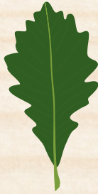
SWAMP WHITE OAK