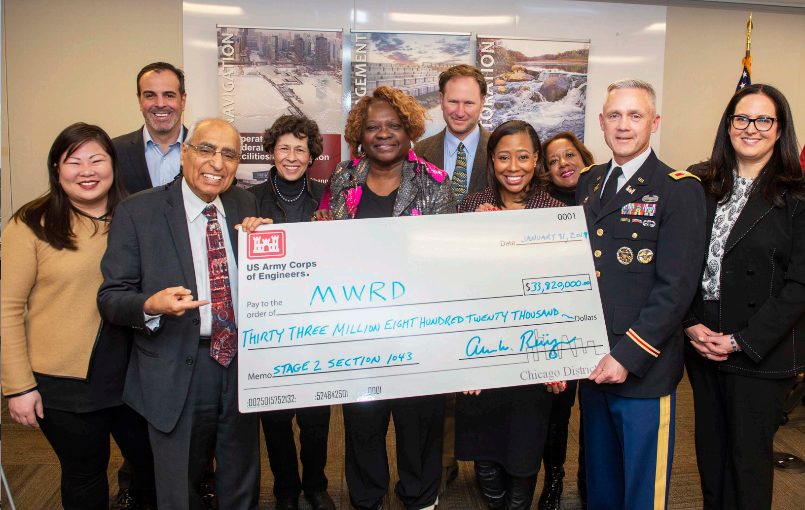
USACE helps to fund the construction of the McCook Reservoir