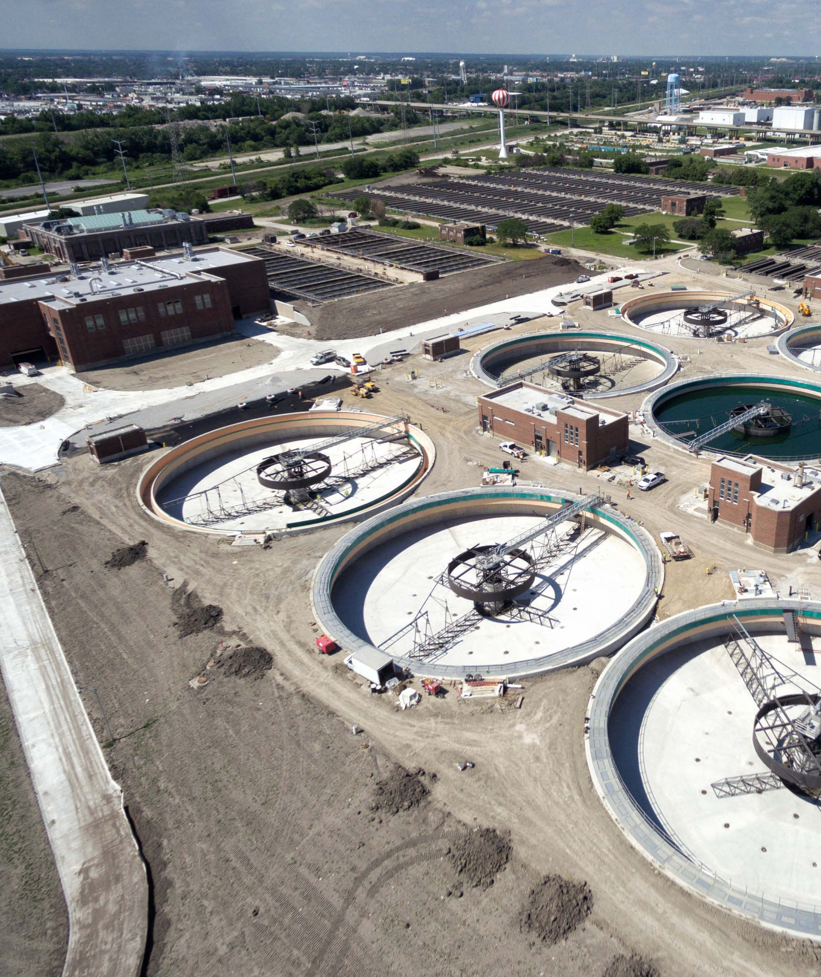
Aerial view of the new primary tanks at the Stickney Water Reclamation Plant in July of 2018