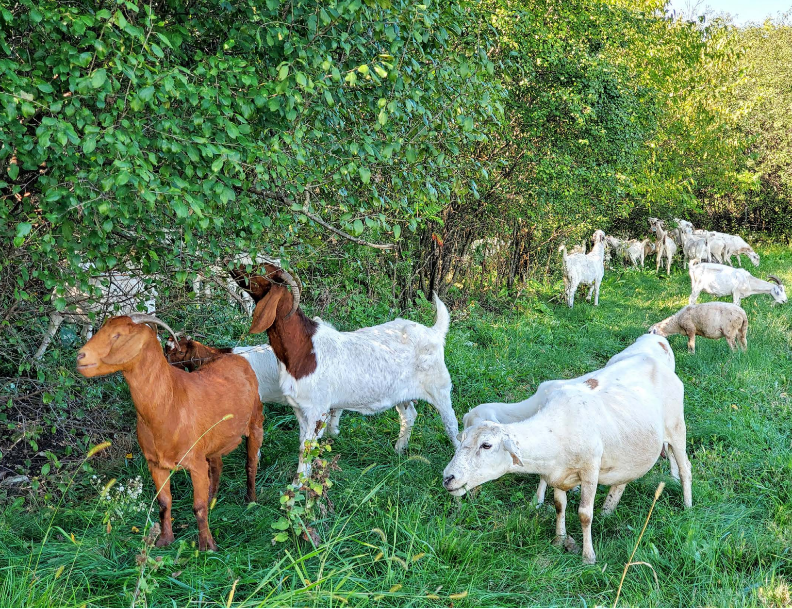
About 50 sheep and goats with Vegetation Solutions peruse the grounds at Lemont Water Reclamation Plant, looking for something to munch on. This form of landscaping will reduce the need for herbicides and fuel to mow and trim plants. The animals are fenced in to graze on invasive plants and overgrowth and work together to cut down plant overgrowth and other rising vegetation. What the sheep don't eat, the goats will, and what the goats don't touch, the sheep will usually devour.