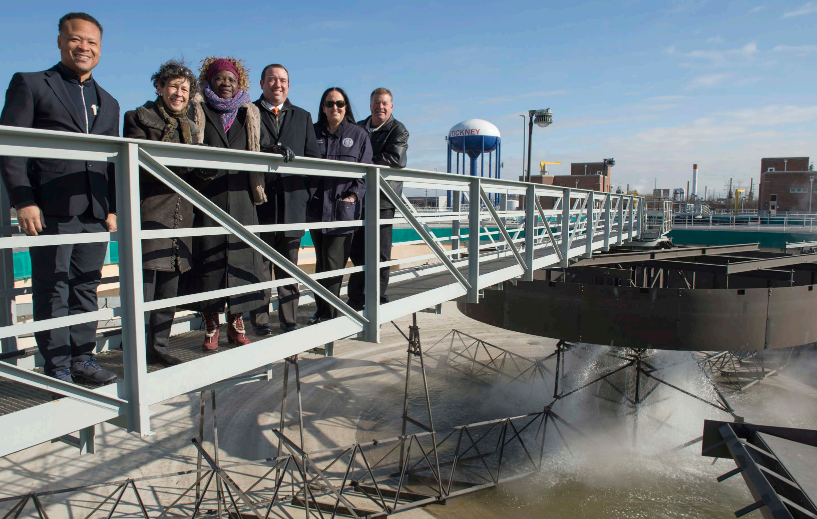
New Primary Settling Tanks at Stickney Water Reclamation Plant