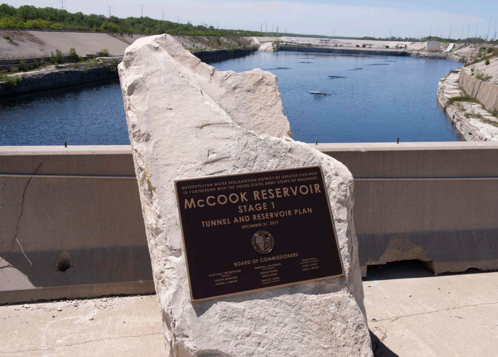
Stage I of the McCook Reservoir was formally unveiled on December 4, 2017 by the Metropolitan Water Reclamation District of Greater Chicago and project partner, the U.S. Army Corps of Engineers.