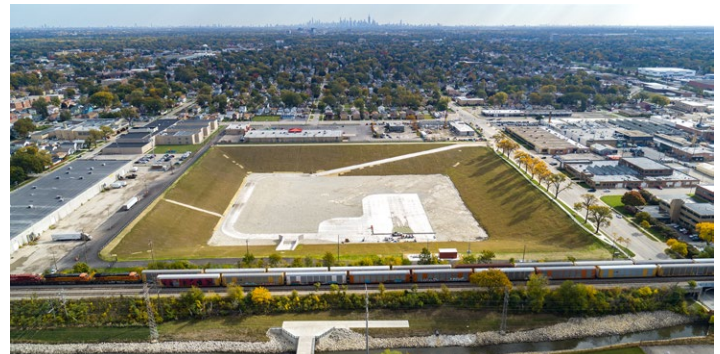
The Addison Creek Reservoir provides 195 million gallons of storage capacity and connects with the Addison Creek Channel (at bottom). Photo taken October 2022.

Several entities were involved during the planning of the project. The MWRD worked closely on the design of the reservoir and channel improvements with Northlake, Melrose Park, Stone Park, Bellwood, Westchester, Broadview, the Illinois Department of Transportation, various railroads and several utility companies. The MWRD was required to obtain permits and approvals from the Illinois Department of Natural Resources, the Illinois Environmental Protection Agency, the United States