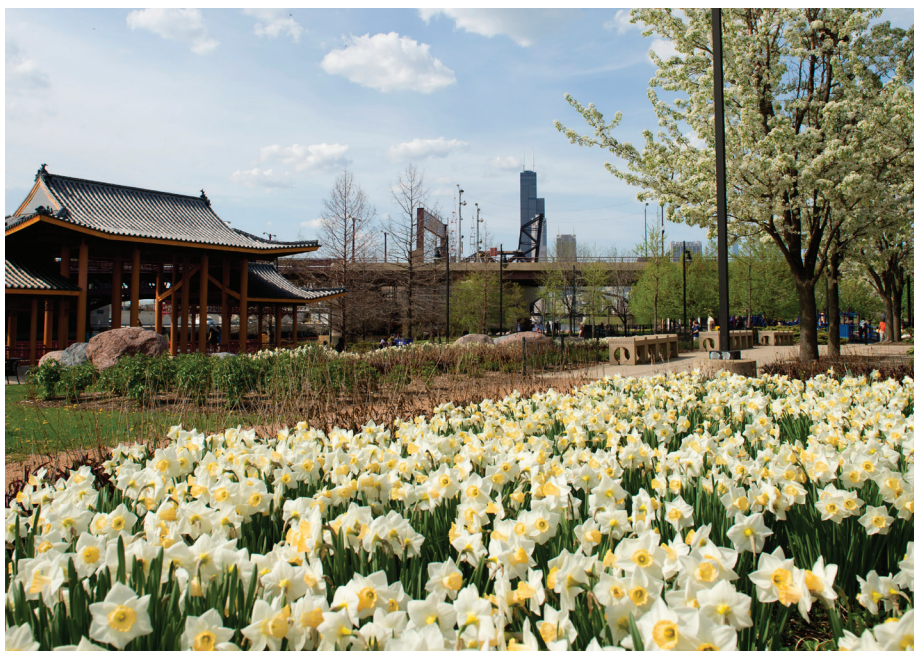
MWRD biosolids, a sustainable alternative to chemical fertilizers, help beautify the Chicago Park District's Ping Tom Park.