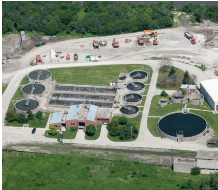
Lemont Water Reclamation Plant

The Lemont Water Reclamation Plant (WRP) is one of seven wastewater treatment facilities owned and operated by the Metropolitan Water Reclamation District of Greater Chicago (MWRD). The MWRD is the wastewater treatment and stormwater management agency for the City of Chicago and 125 Cook County communities. We work every day to mitigate flooding and convert wastewater into valuable resources like clean water, phosphorus, biosolids and natural gas.