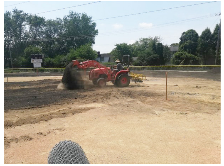
Tractor with bucket attachment for application of heavy rate of biosolids to restore ball fields.

QUESTION: If we do not have our own spreading equipment and elect to use the spreading contractor available through the MWRD, how long will we have to wait?