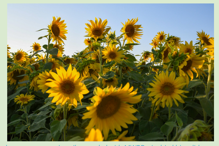
Recycling nutrients and carbon creates something beautiful. The zinnias here were grown in soil amended with MWRD air-dried biosolids. Southside Blooms, a flower farm on Chicago's southside, used EQ Compost to provide a rich growth media for their sunflowers.

Imagine a community in which there is no such thing as waste. Every input was once an output, and every output has a new purpose. In this community, recycling is not just an eco-friendly ideal, but an economic fuel. This is the concept of a circular economy. Biosolids are a key resource in closing the loop for circular economy to be realized in our local communities.