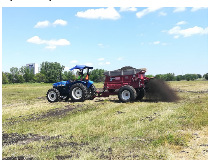
Photo of Tiger spreader topdressing a field with biosolids at a 1/2" rate.

MWRD: Several different types of spreaders can be used for biosolids. The most common spreader for low rates (topdressing) is a manure-type spreader with rear discharge. Other options include application vehicles with rear splash plate or side discharge, also for topdressing, or dump trucks with spreading completed with bulldozers or other heavy machinery for heavy rates at establishment.