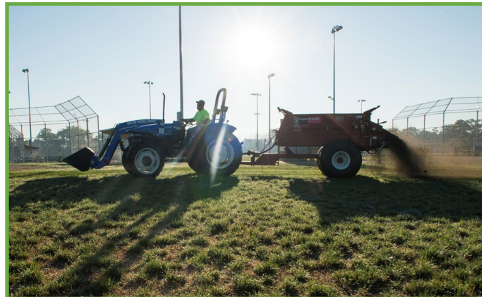
Memorial Park in Midlothian

MWRD soil scientist: How long have you been using MWRD biosolids?