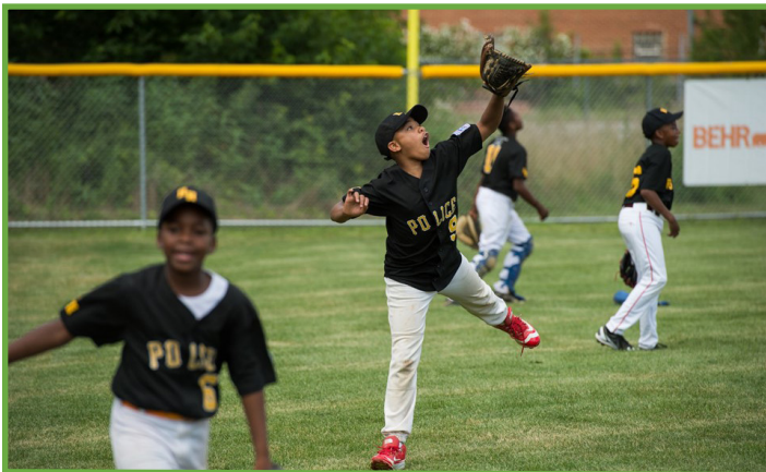
Baseball field in Ford Heights