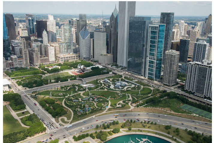
Maggie Daley Park used MWRD biosolids to help create its beautiful lawn.

Location - Rather than hauling valuable biosolids hundreds of miles for farmland application, local usage is a win-win that saves taxpayer