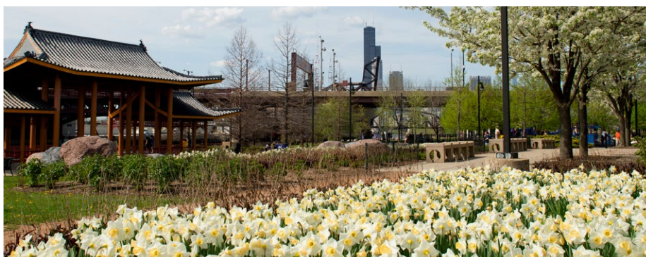
MWRD biosolids, a sustainable alternative to chemical fertilizers, help beautify the Chicago Park District's Ping Tom Park.