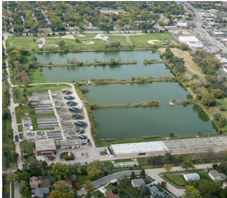
Hanover Park Water Reclamation Plant

The Hanover Park Water Reclamation Plant (WRP) is one of seven wastewater treatment facilities owned and operated by the Metropolitan Water Reclamation District of Greater Chicago (MWRD). The MWRD is the wastewater treatment and stormwater management agency for the City of Chicago and 125 Cook County communities. We work every day to mitigate flooding and convert wastewater into valuable resources like clean water, phosphorus, biosolids and methane.