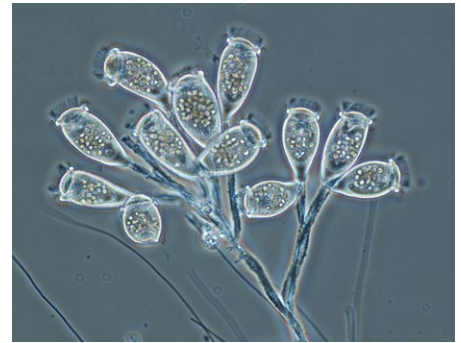
Microbes such as these stalked ciliates help remove bacteria and organic material from the water in secondary treatment.

How do we know we're doing a good job? Wastewater treatment facilities are regulated under the Environmental Protection Agency's National Pollutant Discharge Elimination System (NPDES) permit program. NPDES permits set rigorous standards that the water from the plant must meet. The National Association of Clean Water Agencies has given the Hanover Park WRP the association's highest awards for compliance with these standards. We also see the benefits of our work resulting in increased recreation on the waterways, such as kayaking and canoeing, a rebounding aquatic habitat and increases in fish species. We're reducing energy use at our facilities with a goal of reducing greenhouse gas emissions, and we're recovering valuable resources and expanding the use of biosolids throughout the region.