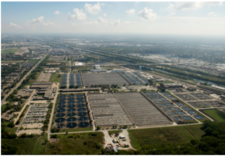
Stickney Water Reclamation Plant with the Chicago Sanitary and Ship Canal

The Stickney Water Reclamation Plant (WRP) is one of seven wastewater treatment facilities owned and operated by the Metropolitan Water Reclamation District of Greater Chicago (MWRD). The MWRD is the wastewater treatment and stormwater management agency for the City of Chicago and 128 Cook County communities. We work every day to mitigate flooding and convert wastewater into valuable resources, like clean water, phosphorus, fertilizers, biosolids and biogas.