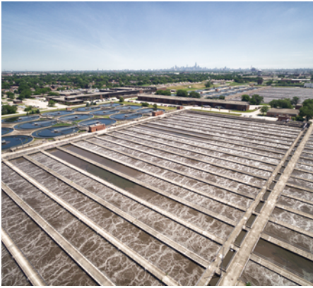
A biological process in 36 acres of aeration tanks removes suspended and dissolved solids from the wastewater.

Secondary treatment: A community of microorganisms helps remove organic material from the wastewater in secondary treatment. The microbes need oxygen to thrive, so air is pumped through the water in aeration tanks. Next, the water enters the final settling tanks where the remaining solids settle to the bottom, and clean water flows out the top. The clean water is released from the Stickney WRP into the Chicago Sanitary and Ship Canal. It only takes 12 hours for wastewater to be converted from raw sewage to clean water. The same transformation would require several weeks in a natural waterway.