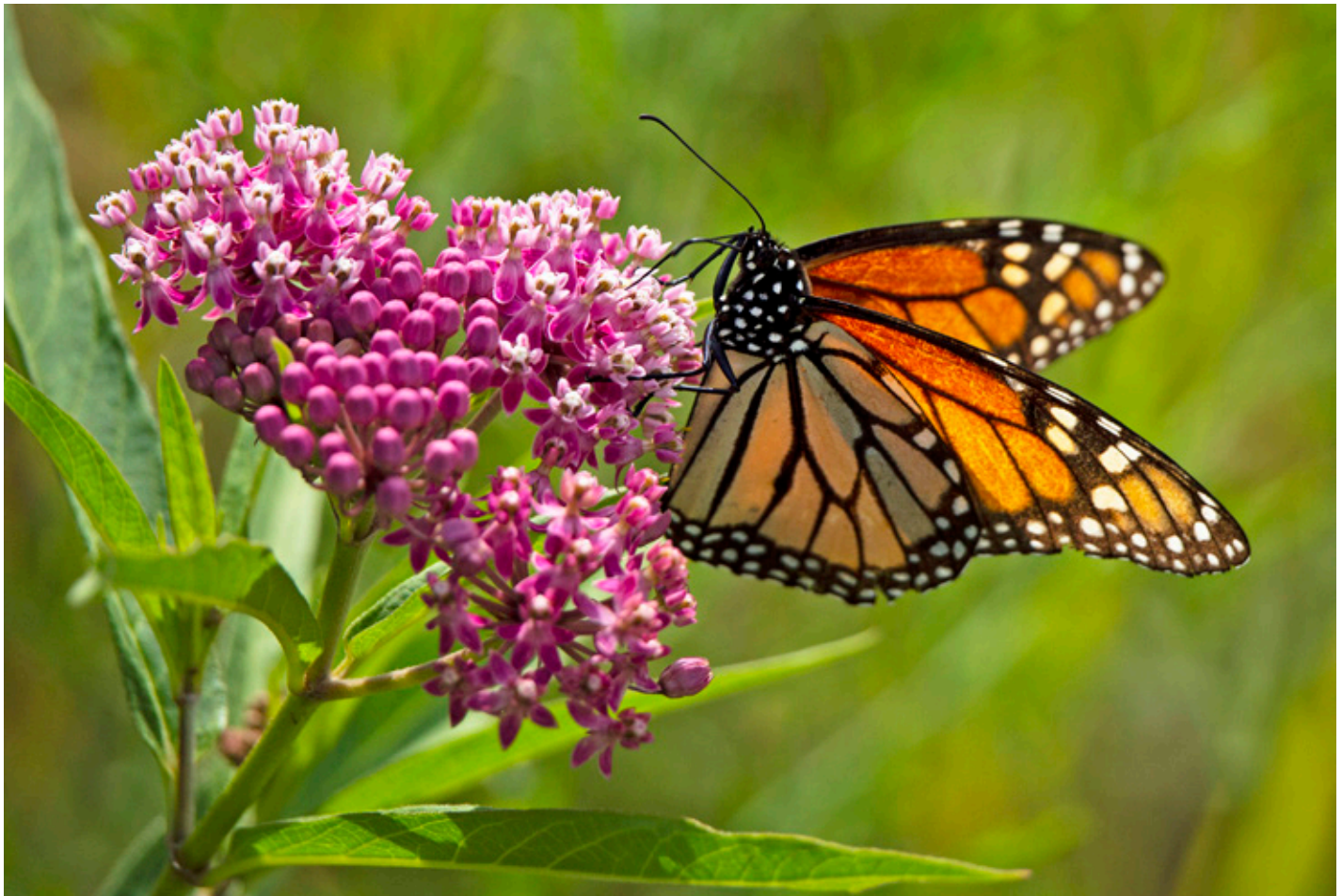
The District maintains a partnership with the Illinois Monarch Project to help save monarch butterflies by distributing free milkweed seed packets and growing milkweed among its more than 50 acres of native prairie landscaping, which serve as certified monarch waystations and work to mitigate stormwater runoff.