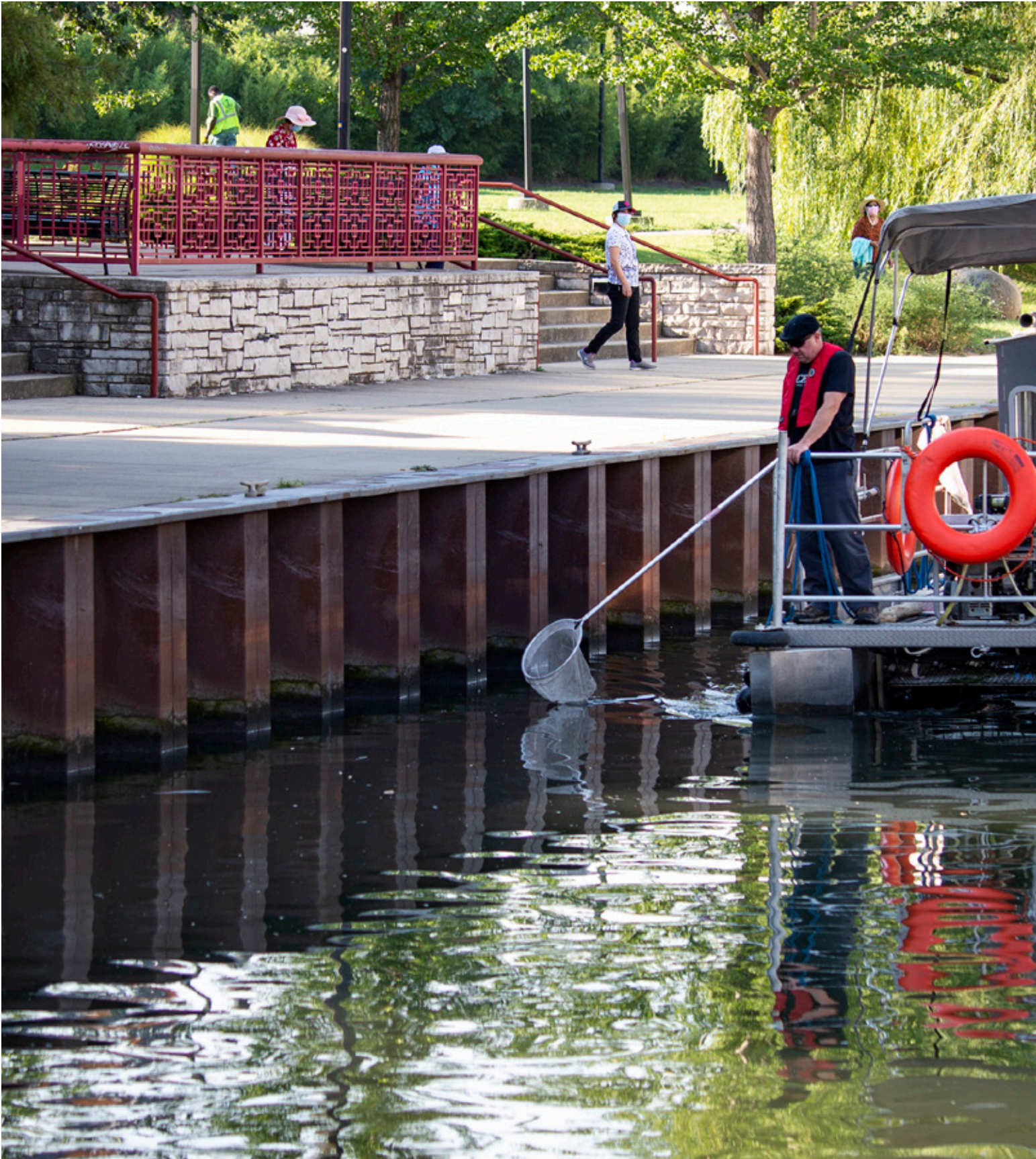
The District's Skim Pickens and its partner the Skimmy Dipper work along the Chicago River to protect the quality of the waterway by removing trash, debris and other floatables polluting the water. The District's skimmer boats provide a vital community service by improving water quality and the recreational experience for thousands of people canoeing, kayaking, boating and enjoying the waterways.