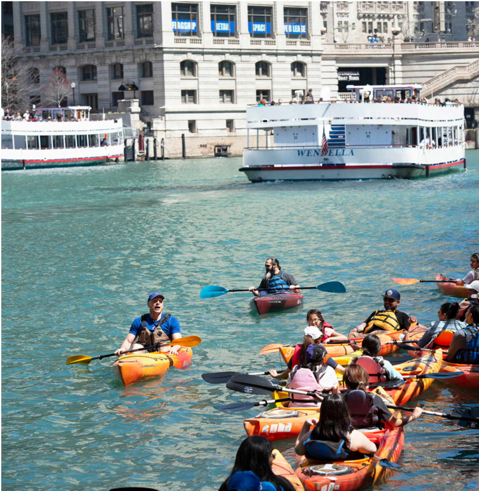
Recreation along the Chicago River has increased thanks to water quality improvements that have drawn new economic development, like the Chicago Riverwalk.