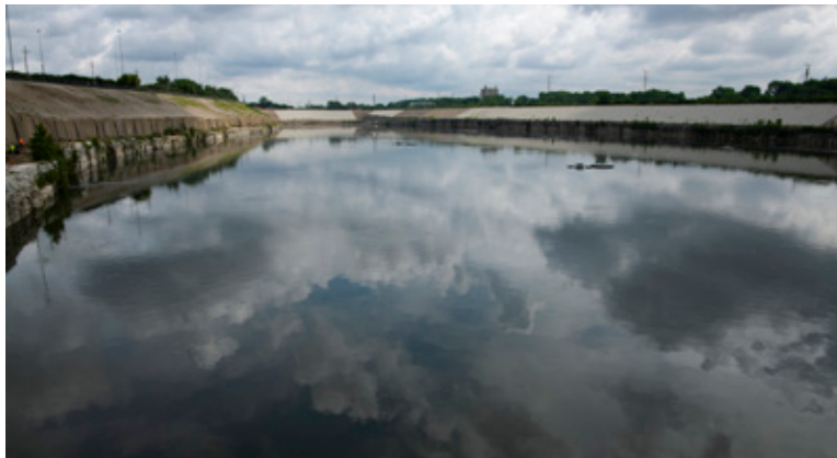
McCook Reservoir Stage 1 can hold 3.5 billion gallons of water and was completed in 2017. Through December 2021, approximately 83 billion gallons of polluted water was captured.

INSTRUMENTATION AND GROUNDWATER MONITORING WELLS: Groundwater monitoring wells, piezometers, inclinometers, and other instrumentation were provided to monitor the reservoir under several different contracts. The groundwater monitoring wells and instrumentation for Stage 1 have been installed and are now functioning.