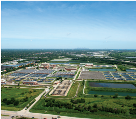
A view of Calumet WRP, looking north toward downtown Chicago

The Calumet Water Reclamation Plant (WRP) is one of seven wastewater treatment facilities owned and operated by the Metropolitan Water Reclamation District of Greater Chicago (MWRD). The MWRD is the wastewater treatment and stormwater management agency for the City of Chicago and 125 Cook County communities. We work every day to mitigate flooding and convert wastewater into valuable resources like clean water, phosphorus, biosolids and natural gas.